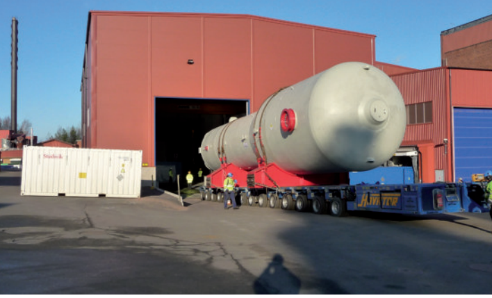
9 x 310 t Steam Generators Ringhals NPP (SE)