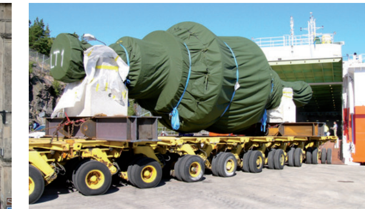
3500 t Turbine Components Swedish NPPs